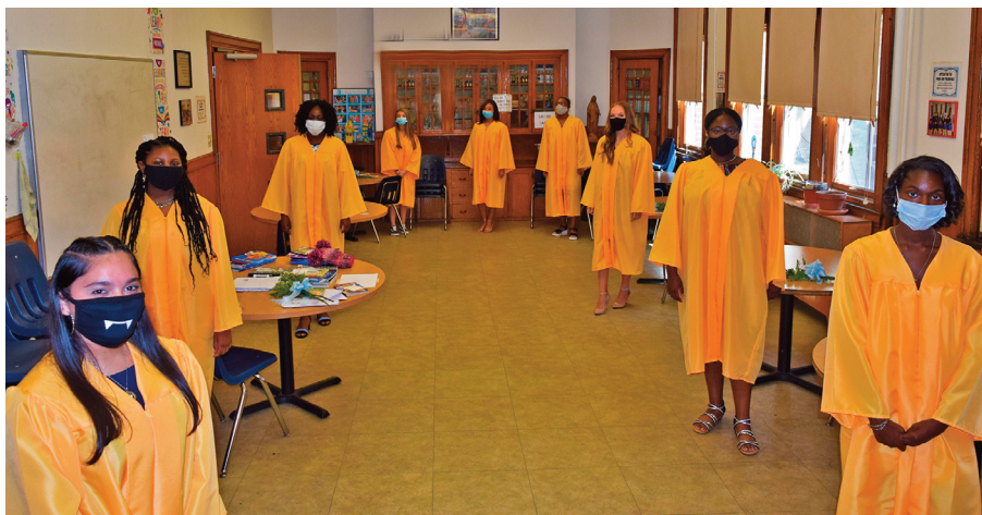
LSA Students at the 2020 Graduation!