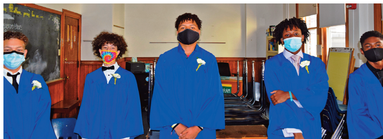
LSA Students ready for Graduation Day!