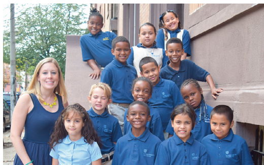
The class of 2021 posing for their first picture as third graders at LSA in 2015.