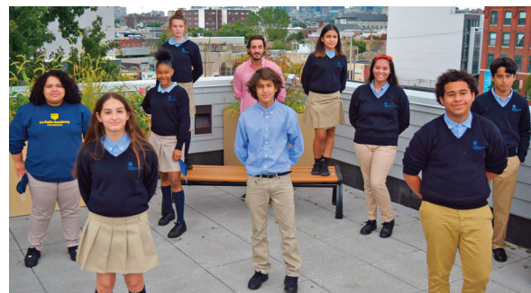
Eighth graders on their first day of school in 2020 (7 students virtual).