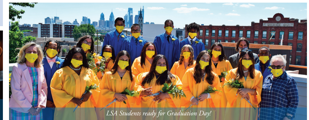
LSA Students ready for Graduation Day!